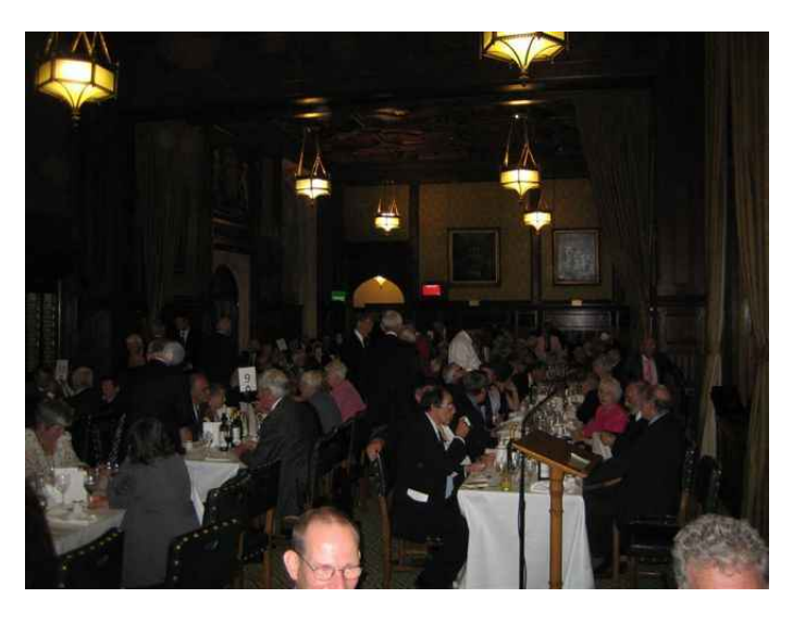
Enjoying dinner in the historic House of Lords