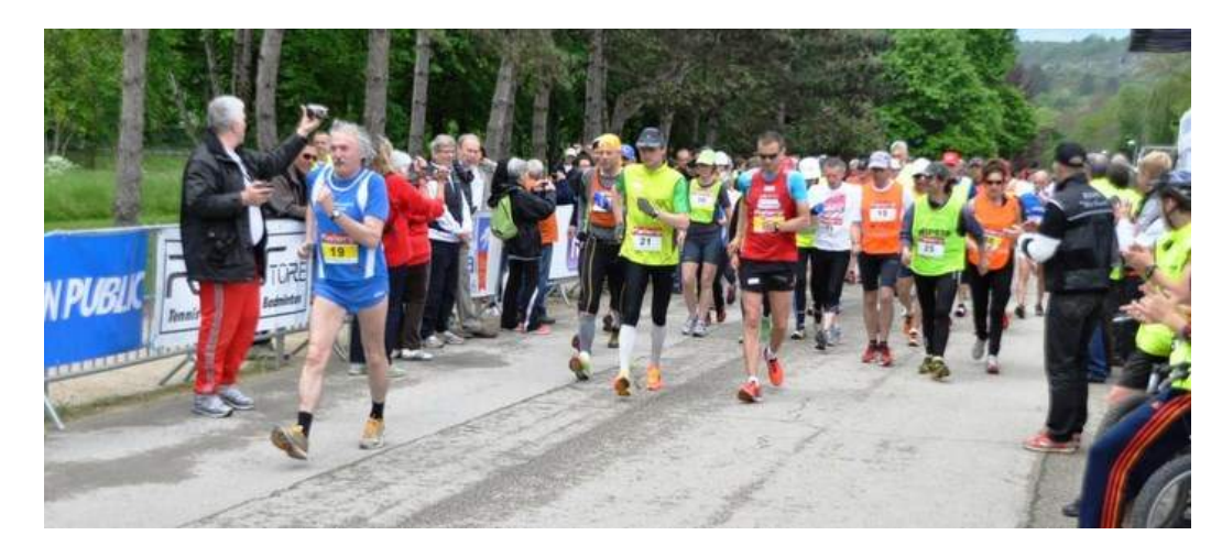
The start of the 24 Hour event