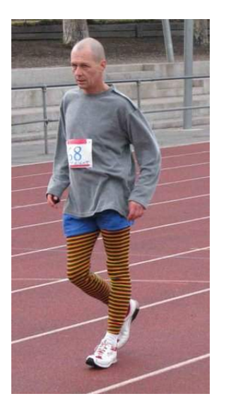
Rudolf in track and ultra modes