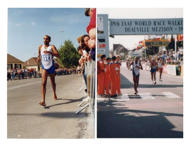
Kumaran competing in the 1999 World Cup in Mezidon