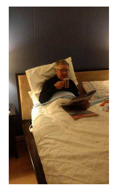
Finally, a chance to read the paper and have a sleepin