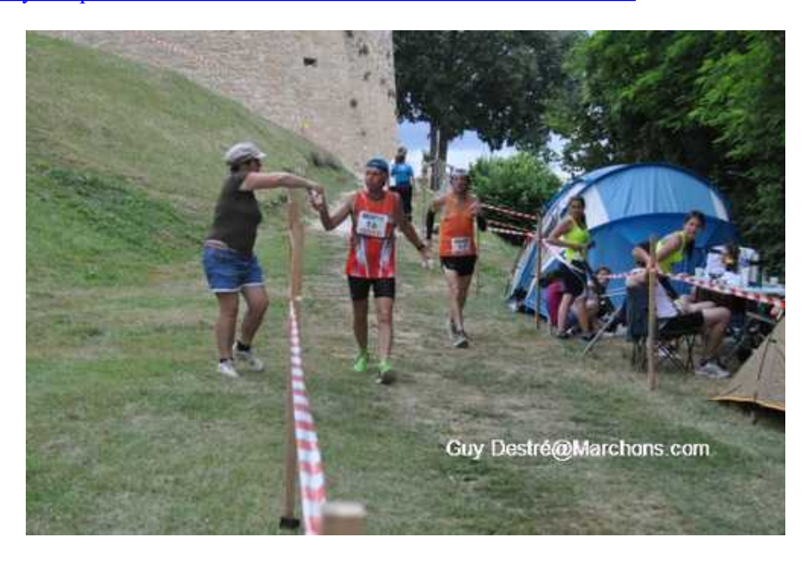
What does up must come down – a tough course in Montguyon

\frac{https://photos.google.com/share/AF1QipMzrjM2EnfHMhLrHWpEFFbGSEoc6NjSQoCJdv7zCkewzbpA2k2c49wz5oZnpaz3nA?hl=fr&key=aWpJdzBULXVZLUVEVF9iWGNDOGhLVzZVX1lURWtB.}