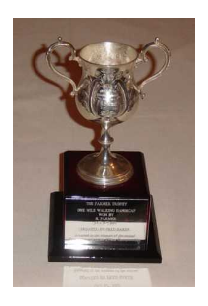
The Farmer Trophy – before and after refurbishment