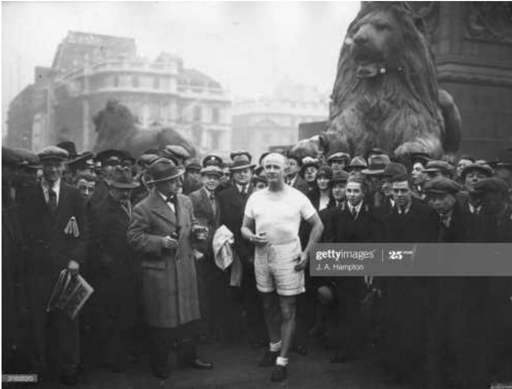
13 th November 1930: Walking champion George Cummings sets out on a 135 mile walk from Trafalgar Square in London to Burton, with no sustenance other than beer, in order to prove its sustaining properties.

witness the start of his walk from London to Burton.